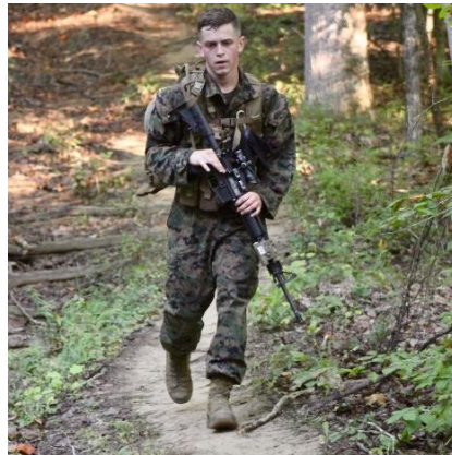
Echo Co 5-19, running the Endurance Course

As mentioned in our "Contact Us" section, if you have any questions or would like a TBS mentor, please send your question or request to Student Liaison Officers@USMC.mil .