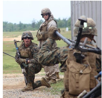
Charlie Co 3-19, conducting a live fire range